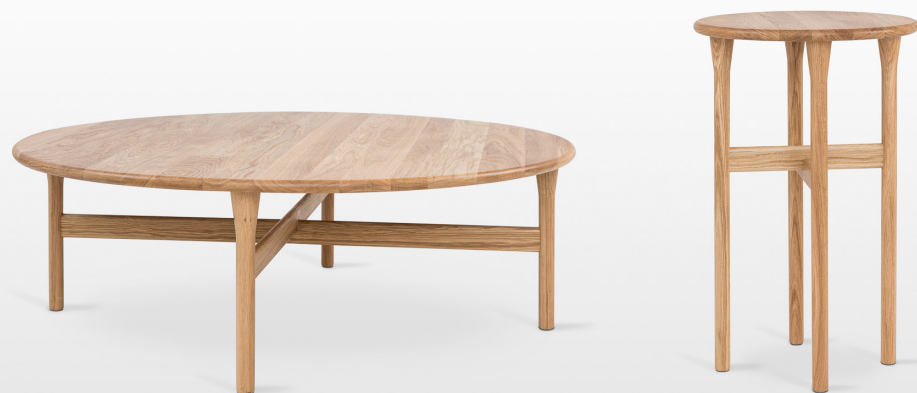
Table tops Solid wood (oak glulam) in combination with oak wooden legs, plywood covered with oak veneer in combination with steel legs

Structural Powder-coated steel legs in the available colour range, wooden (oak) legs painted in available colour range